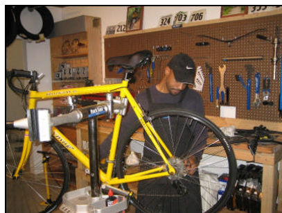
Services (Labor charges only)